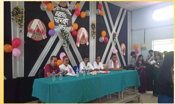
Snapshot 2 of Departmental Fresher, Department of Political Science, CAC