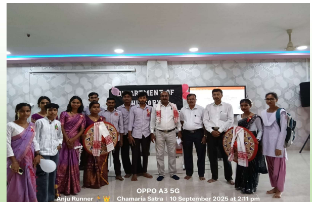
File Photo: Departmental Freshers, Department of History, CAC