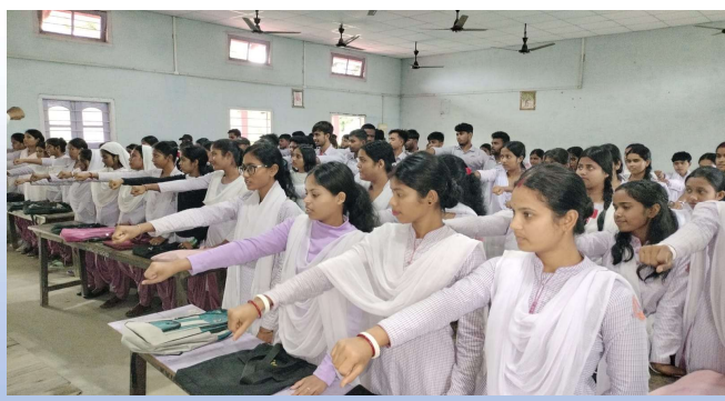
Oath of Rasthriya Ekata Bharat by students