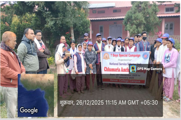
7 Days Special Camp NSS Unit of College