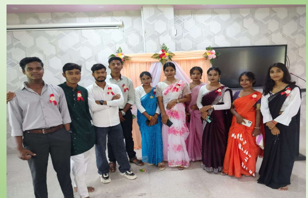
File Photo: Departmental Fresher: Department of Economics, CAC