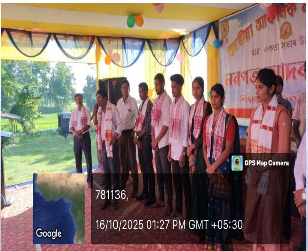
Lecture delivery of hon'ble chief guest on Freshers Day of College in 2025