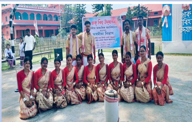
Artist of College during Pre-Bihu Observation in CA College