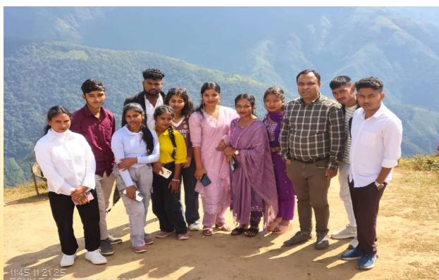
Educational tour, Department of Economics, CAC