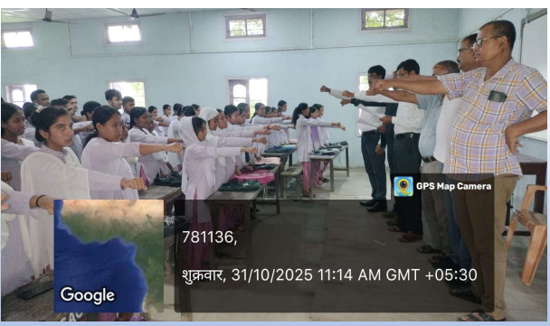
Oath of Rasthriya Ekata Bharat by Teachers-Students