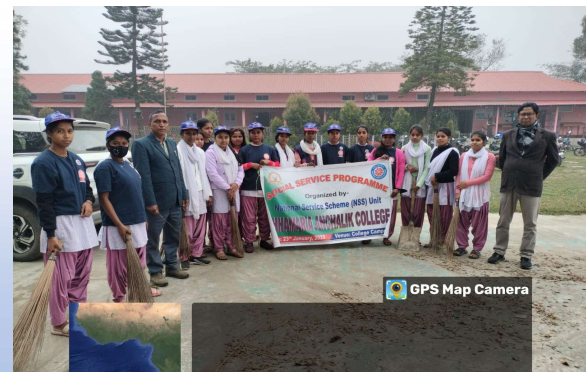
Social Service Programme, CAC