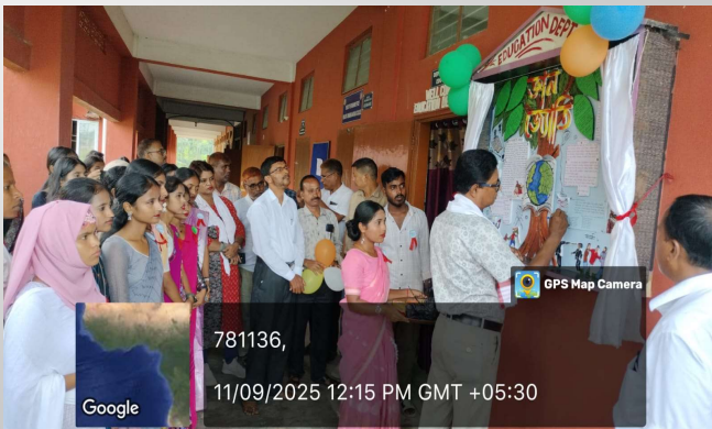
Departmental Wall Magazine inaugurated by hon'ble Principal