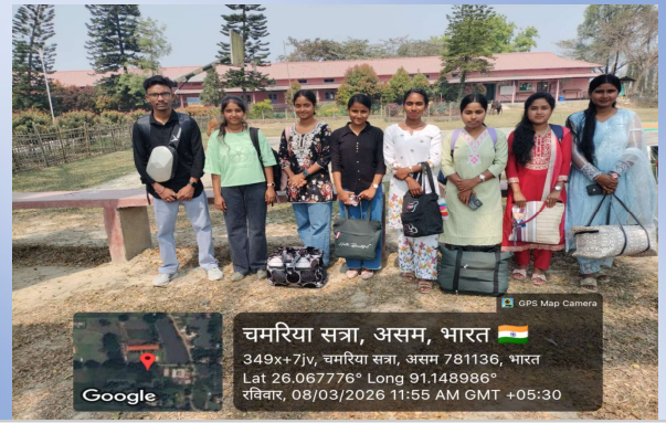
College Students on the way to Disaster Training in Guwahati