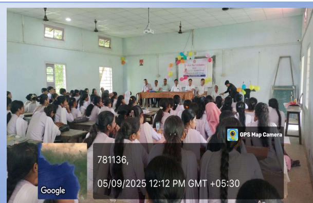
Teachers and Students together on Teachers' Day, CAC