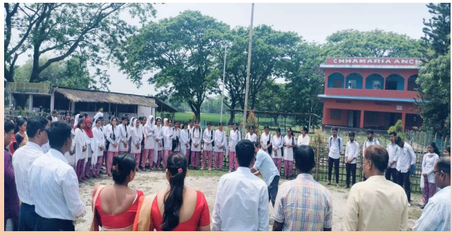
Moment of flag hoisting in 79 th Independence Day