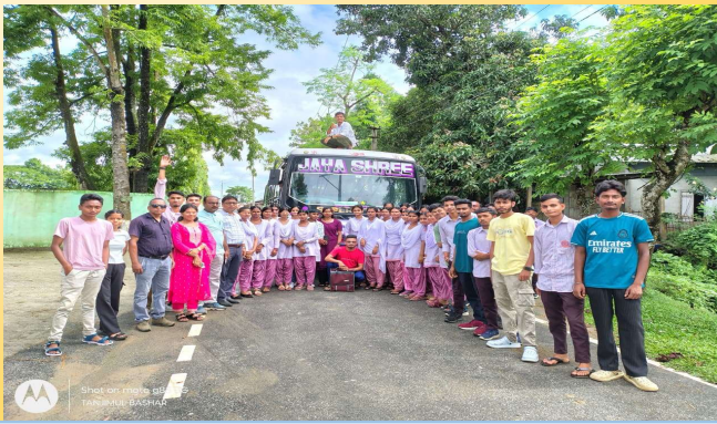
File Photo: Departmental Excursion, Department of History, CAC