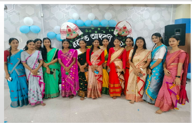
Snapshot 1 of Departmental Fresher, Department of Assamese, CAC