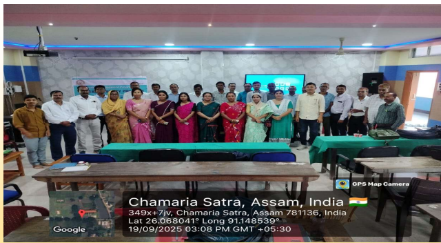
Participants of College by ICT Academy Led FDP of CAC (Concluding Day)