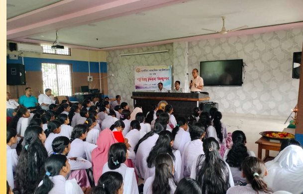
Speech Delivery of Hon'ble President, GB at College Foundation Day