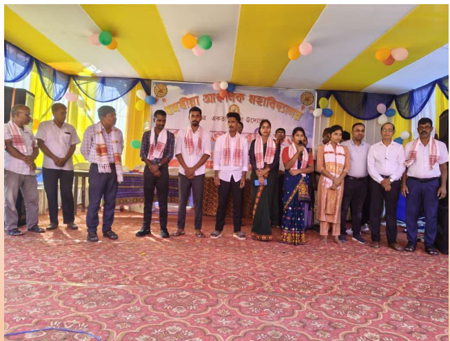
File Photo: Ex-students of College, now Govt. (State and Central) Employees, Felicitated on College Freshers' Day in 2025