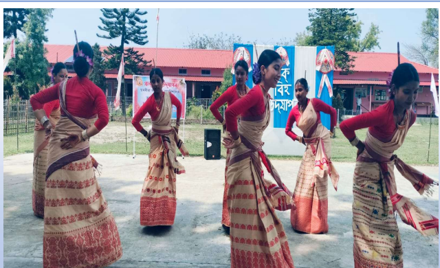
Snapshot 1 of Bihu Artist at College on Pre-Bihu Day