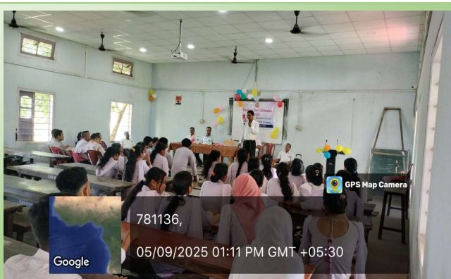
Speech Delivery of Hon'ble Principal of College on Teachers' Day, CAC