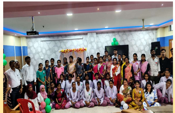
File Photo: Departmental Freshers, Department of Education, CAC